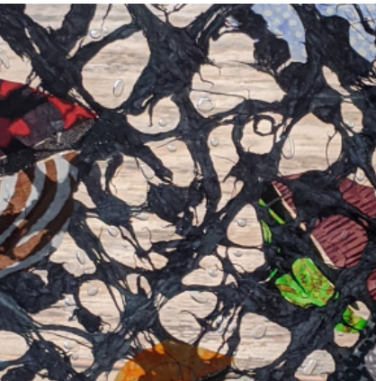
BIOME INSPIRED SIGNAGE